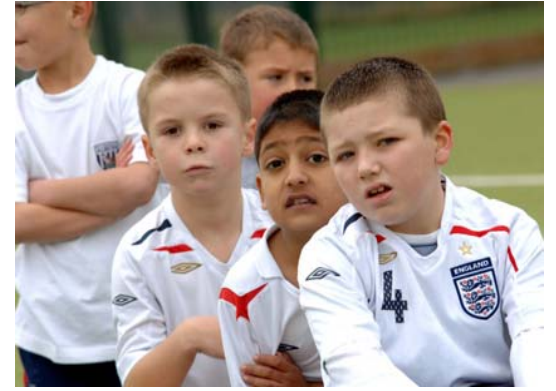
Primary activities at Greet Green Schools