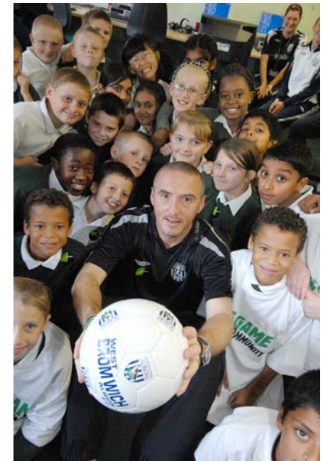
Kick it out at Ryders Green Primary