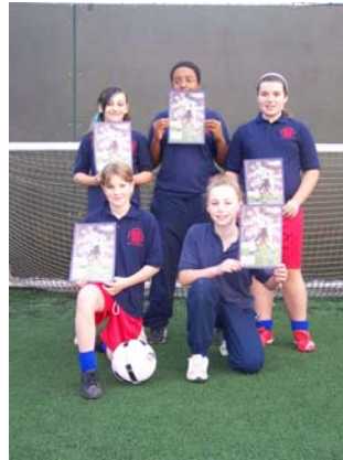
Walsall Schools League Winners!