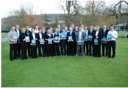
FA leadership course graduates!