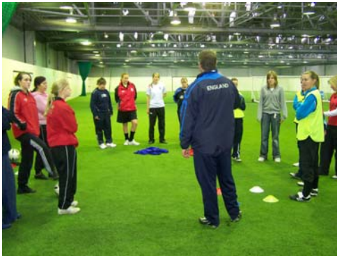
Mentoring Project Launch-9 th Dec