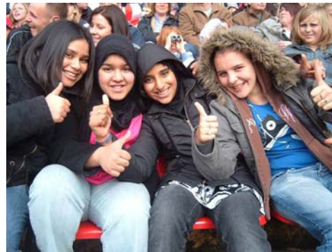
George Salters School Girls attended Womens Game at Bescot